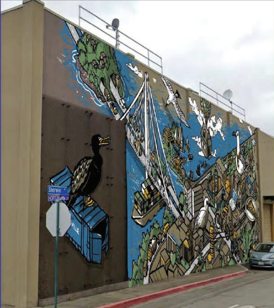
Exhibit B Mural as Proposed in Location, on Sherwin at Horton