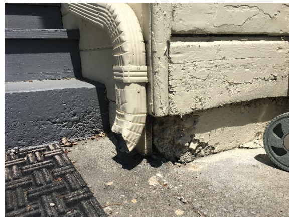
Foundation concrete leaching