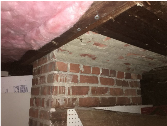
Unreinforced fireplace and hearth