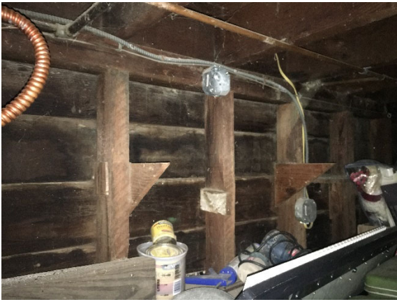
No shear walls