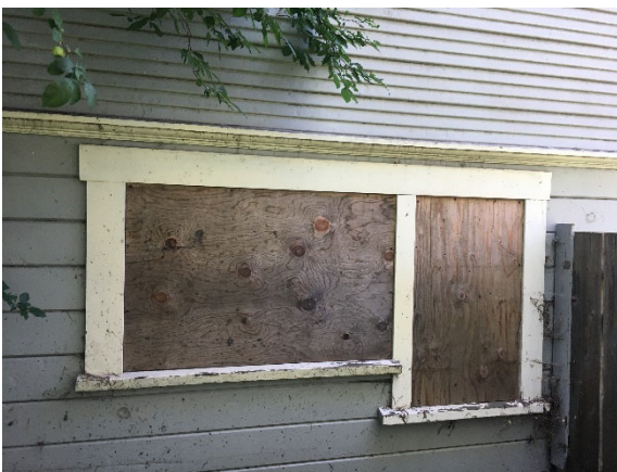
Missing windows due to repeated break-ins (side yard)