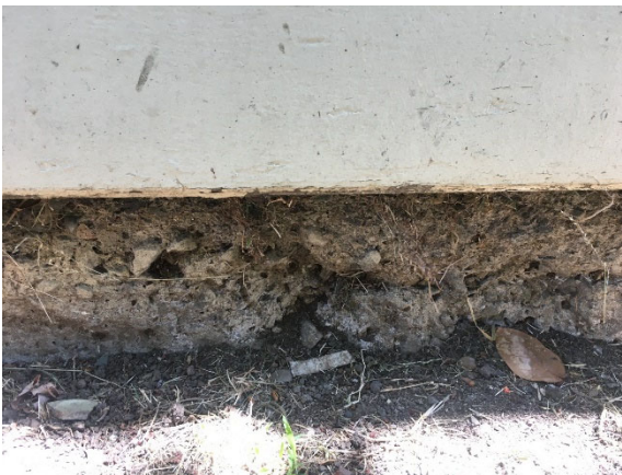
Foundation concrete leaching