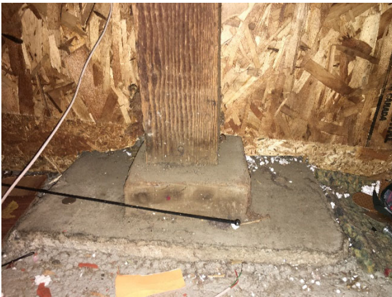
Unreinforced footings; failing footings