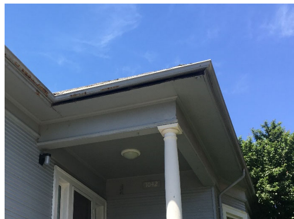
Separation between gutter and eave; roof rot