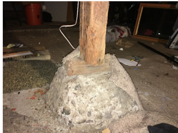
Unreinforced footings; failing footings