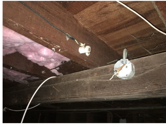
Exposed insulation; knob and tube wiring