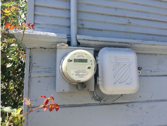
Knob and tube wiring; fuses, no circuit breakers