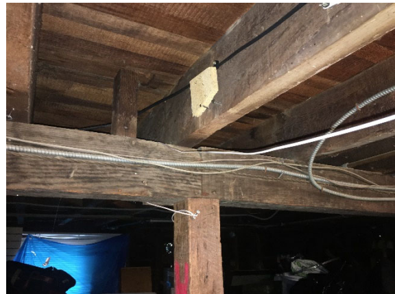
No seismic bracing/lateral ties