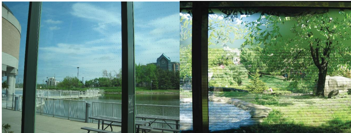
Markham, Ontario Civic Center