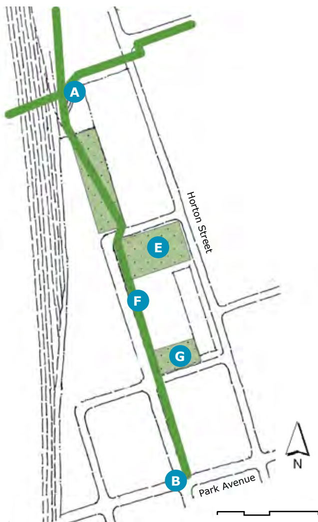
Emeryville Greenway Horton Landing - Park Avenue: Concept C