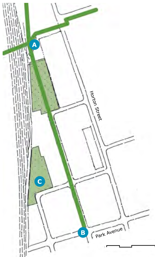
Emeryville Greenway Horton Landing - Park Avenue: Concept A