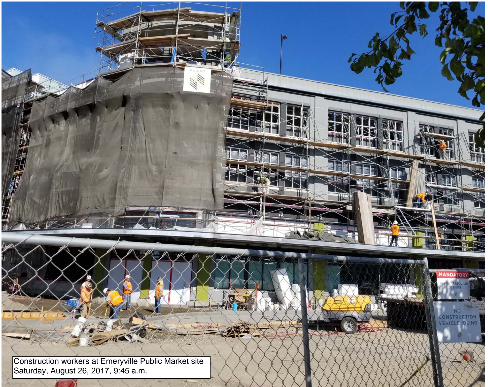
Construction workers at Emeryville Public Market site Saturday, August 26, 2017, 9:45 a.m.