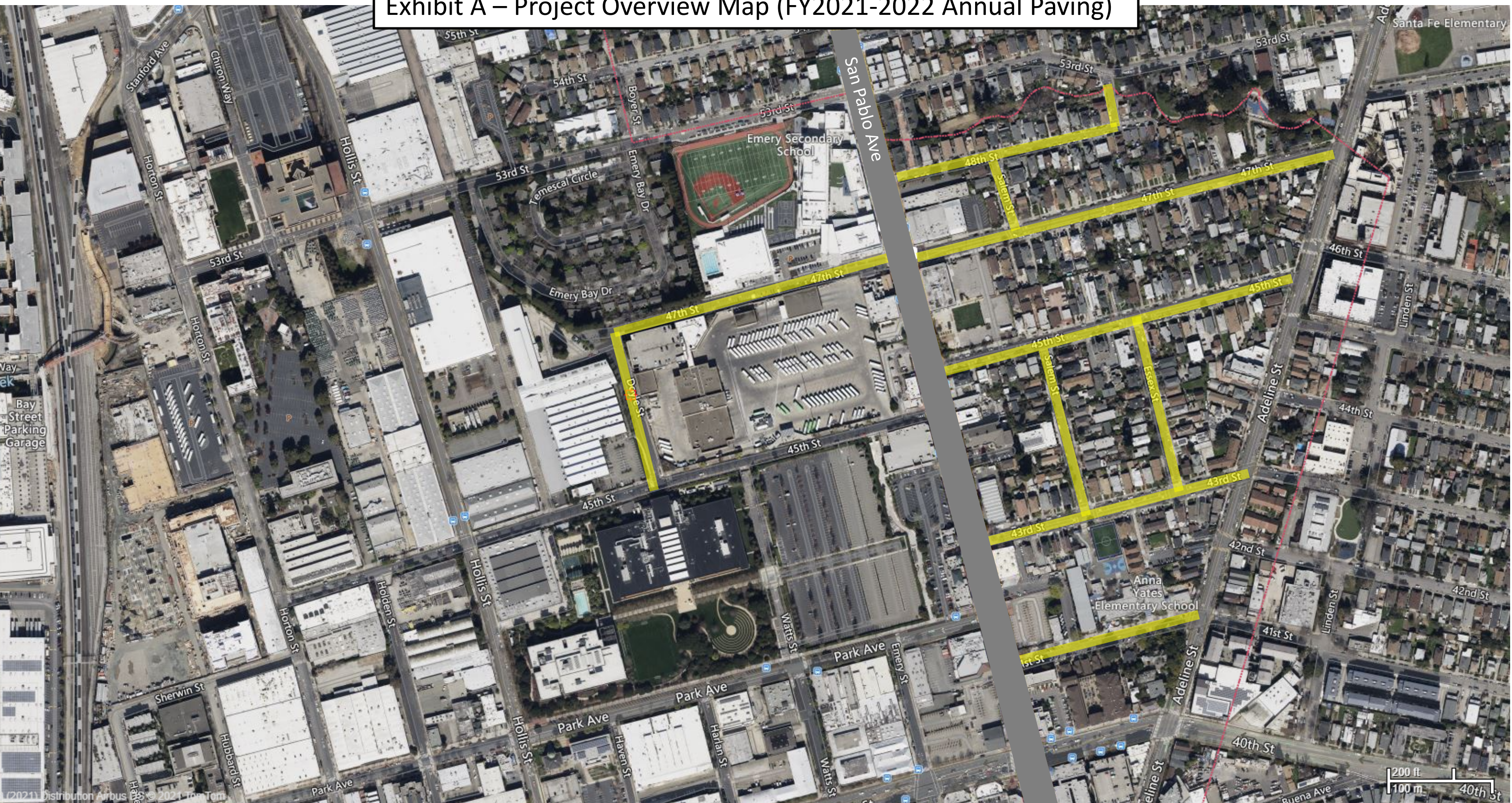
Exhibit A – Project Overview Map (FY2021-2022 Annual Paving)